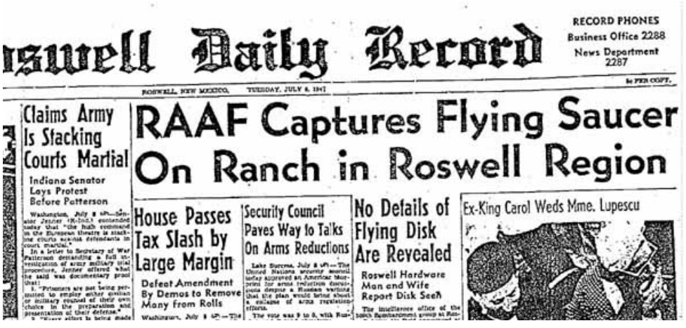
The famous front of the Roswell Daily Rzecond from July 8, 1947 stating that a flying saucer had been recovered.

“The many rumors regarding the flying disk became a reality yesterday when the intelligence office of the 509th Bomb Group of the Eight Air Force, Roswell Army Air Field, was fortunate enough to gain possession of a disc through the co-operation of one of the local ranchers and the Sheriff’s Office of Chaves county. The flying object landed on a ranch near Roswell sometime last week. Not having phone facilities, the rancher stored the disc until such time as he was able to contact the Sheriff’s office, who in turn notified Major Jesse A. Marcel, of the 509th Bomb Group Intelligence office. Action was immediately taken and the disc was picked up at the rancher’s home. It was